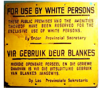
Apartheid - before 1994.

1961. Only whites could vote, or join the government. In 1948 the ruling whites passed apartheid laws, which were even more unfair to blacks. The ANC (African National Congress) fought apartheid.