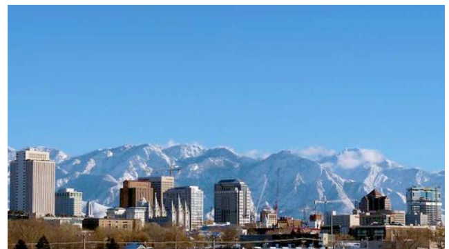
Salt Lake City

For religious reasons, Mormons are interested in genealogies – that is, family trees. In Salt Lake City there is a library with birth records from around the world. It's an interesting place for those who want to know more about their family history.