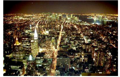
The lights of Manhattan by night without blackout.

At the same time subways and elevators stopped, street lights and traffic lights went out. Water pumps failed and left kitchens, bathrooms and toilets without water.