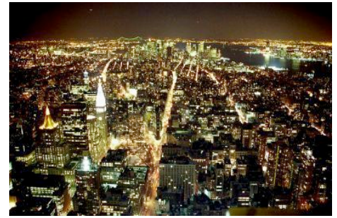
The lights of Manhattan by night without blackout.

At the same time subways and elevators stopped, street lights and traffic lights went out. Water pumps failed and left kitchens, bathrooms and toilets without water.